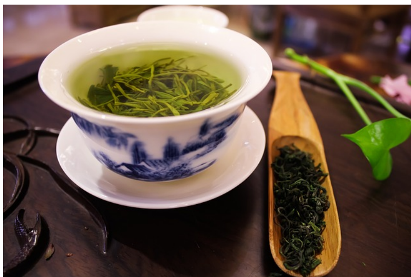
Figure 1 Tea Ceremony