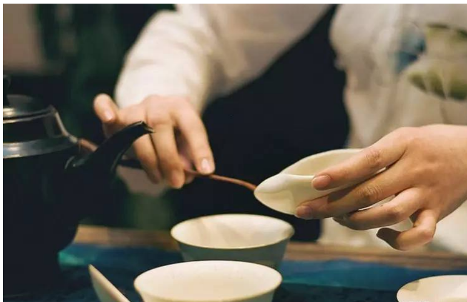
Figure 3 Inheriting Chinese tea culture